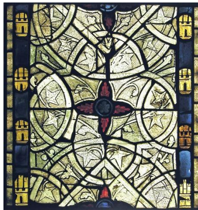
Grisaille Panel; Made in Rouen, Normandy, France, ca. 1265

Go to westkingdom.org Click on Calendars. Then click on Activities. Scroll through for the various Newcomer 101 classes. Click on them to get information and meeting links and the programs web link. You can even add them to your own electronic calendar. Visit/Subscribe to the West Kingdom YouTube Channel to see the taped versions when they are posted after the fact. The Newcomer 101 classes have also been gathered together in their own YouTube playlist .