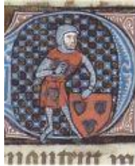
Geoffrey De Charney

In the spirit of Geoffrey De Charney and his book of chivalry: “ qui plus fait, mieux vault, ” i.e., “he who does more is worth more.” As such, our bear pit tourney will reflect this. The tourney will run from after morning court until 2pm. Take breaks as you wish but as long as the list is open in this time you can fight.