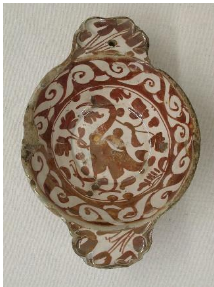
Tin-glazed and Luster-Painted Earthenware Bowl; Spanish, Valencia; 17 th century

If sending a check, please make it payable to SCA, Inc., and mail it to: SCA Inc., Attn: The Signorotti Fund, P.O. Box 611928, San Jose, CA 95161. For more information, please email membership@sca.org .