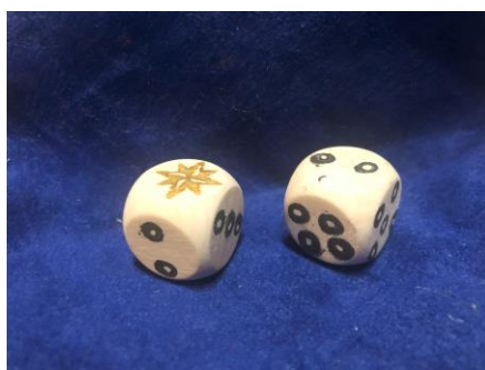
Stamped dice made by Nordskogen for Royal largesse and presented to the Crown at Fall Coronation (Sept. 14)