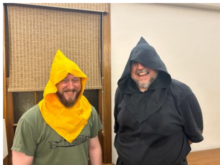
Hoods! (from the Sept. 11 meeting)