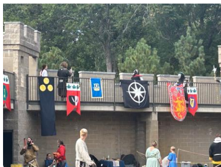
Rapier combat on the castle terrace at Fall Coronation