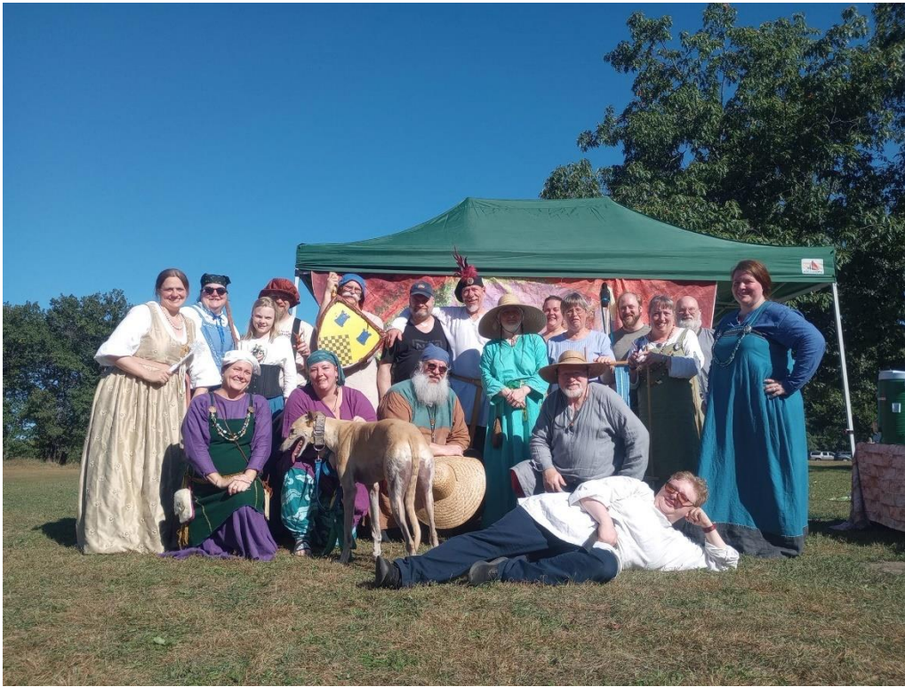
Group Photo by Lord Alex