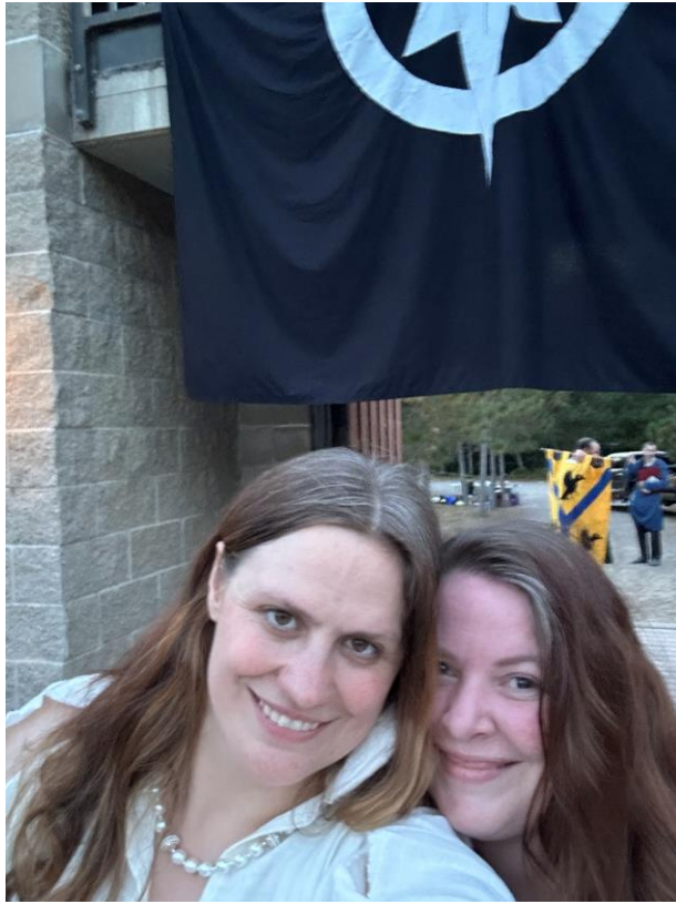
Our Baronnesses at Fall Coronation