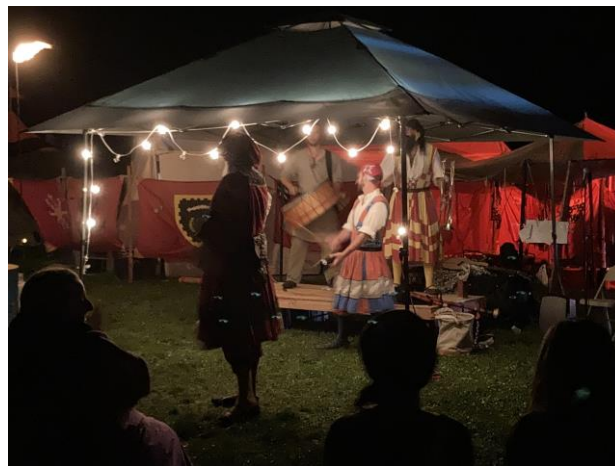
Crashing the Aethelmearc kingdom party to see the Wolgemut concert