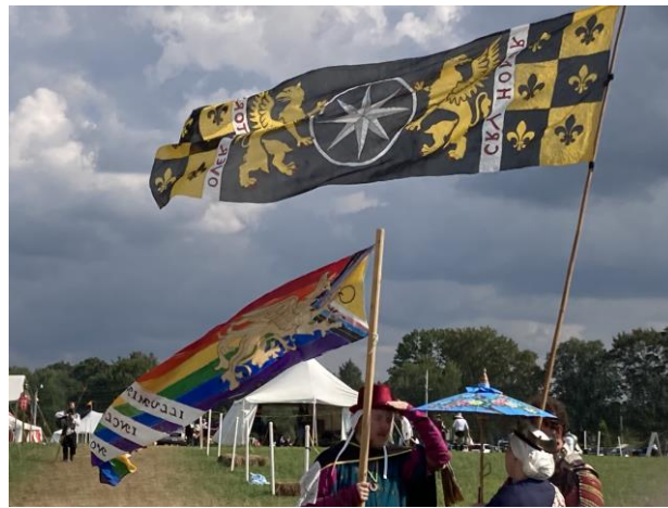
Banners fly on the battlefield before Northshield court