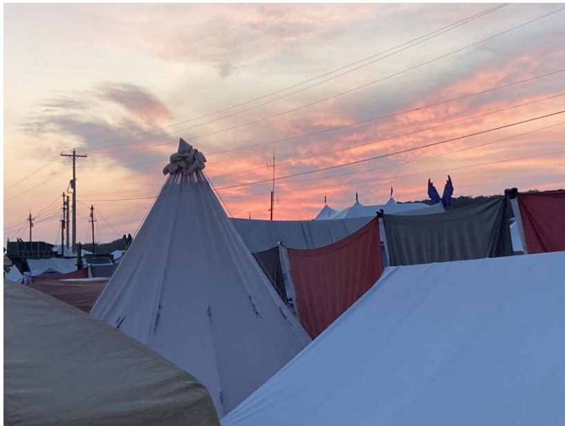
The sun sets over Northshield populace camp

If you have any questions about anything in this newsletter, please feel free to contact the Chronicler at: 651-605-1085 (before 10 pm) or at chronicler@nordskogen.org