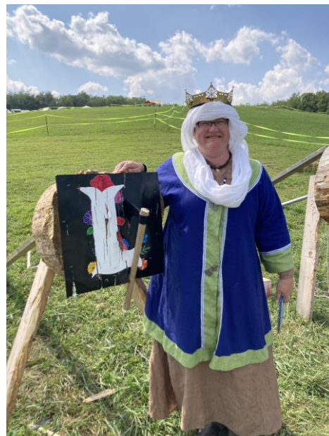
Her Excellency got to try out the Known World Thrown Weapons Champions' course