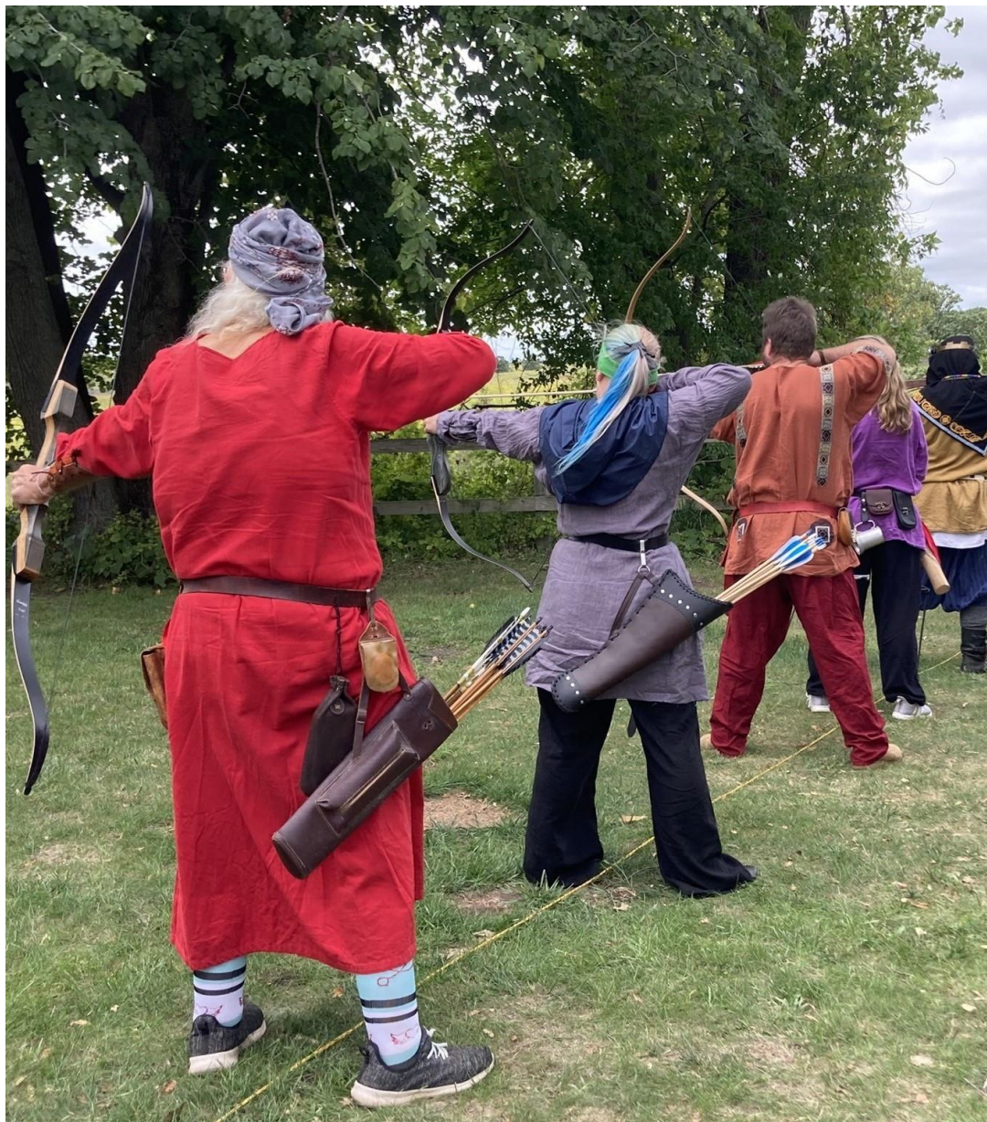
A new archery champion is chosen.