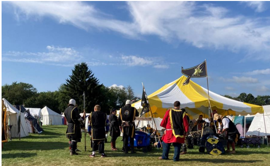
Northshield fighters gather for the march to the battlefield