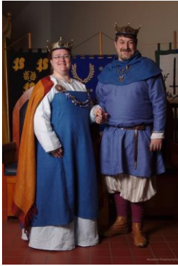
Photo of Their Excellencies