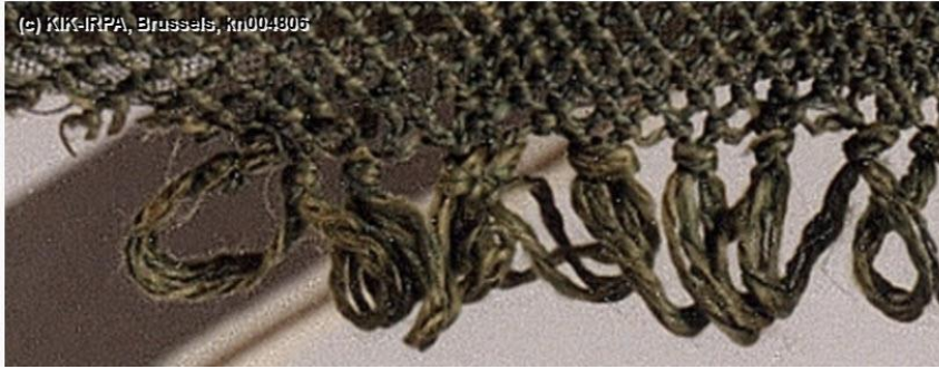
Fig 6. Embroidered Hairnet. C 1201-1300. Silk checkpoint embroidery. Saint Paul's Cathedral, Liège.

Fig 6 provides a close up of the additional loops on this net. It shows a style of additional loops partway around the bottom of the net. Another piece from St. Truiden (13th Century) exhibits loops like this along part of the edge. There are other types of additional loops, more like just another row of netting, which can be seen on other nets such as the one in Fig 3 and the one in Fig 9.