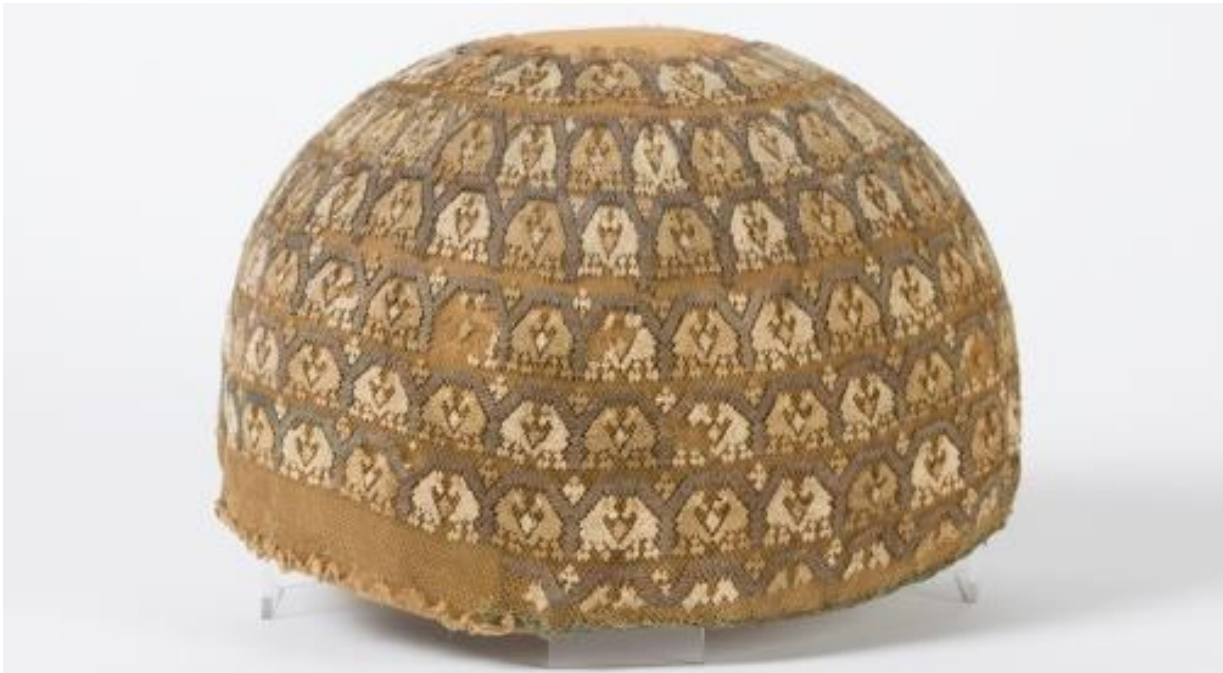
Fig 8. Embroidered Hairnet. C 1201-1300. Silk knotted net with silk embroidery. Assumption Church O.L.Vrouw, Saint Truiden.

Fig 9 is a close-up of the transition that clearly shows the braid is sewn on (around the braid rather than through it in this case) in a thread that matched the braid in color, and then the additional loops which were netted on to about every 4 th loop at a much larger gauge than the rest of the net. It is clear the braid would easily have fit through these additional loops. From other images of this piece, it is clear that the loops went around about half of the piece.