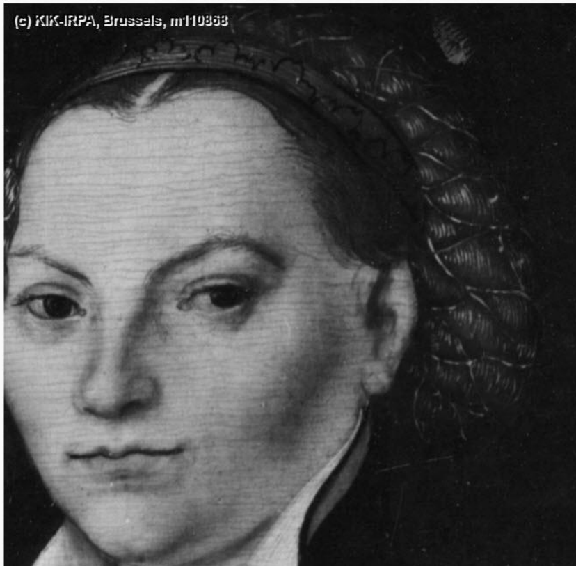
Fig 2. Portrait of Katharina von Bora, spouse of Martin Luther. 1525. Oil painting on beech panel. Prussian Cultural Heritage Foundation, Berlin, German.

The next part of the equation was the attachment of the braid or band to the net. The sources I could find stated that the braid or band was sewn to the net 1 and the visible evidence initially seemed to support this. But that solution, sewing on the edging, left me with questions and problems. It doesn't really work well for fitting or any practical purposes of the edging material to sew it to the net all the way around. So, in taking another look at the extant finds, I noticed something important. On pieces where there is enough of the edge left to tell what was done, the braid or band is sewn on to part of the net. It is also very intentionally not sewn on the other part. On the other half of the net, presumably the part of the net that would not show when worn (under the hair), there was an additional set/partial row of larger loops attached to the edge of the net. This additional/partial row of loops were larger loops than present in the rest of the net. This was mainly because the gauge of this row would have needed to be larger to have allowed the edging material to be gathered through the additional loops. This setup would have allowed for the edging material to be tied. This pattern of half sewing/half gathering edging is visible on so many of the nets that have intact edges that there is enough evidence to indicate that this was a common finishing practice.