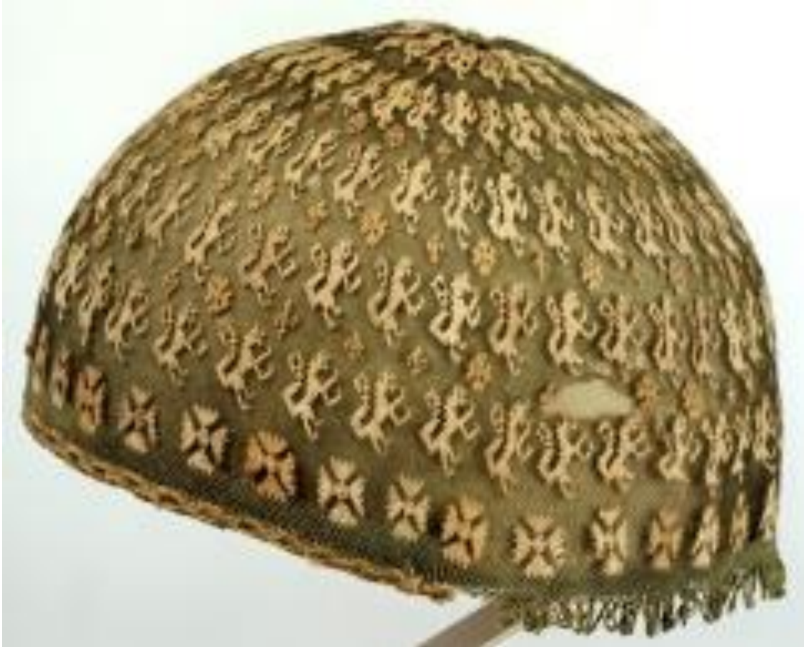
Fig 4. Embroidered Hairnet. C 1201-1300. Silk checkpoint embroidery. Saint Paul's Cathedral, Liège.