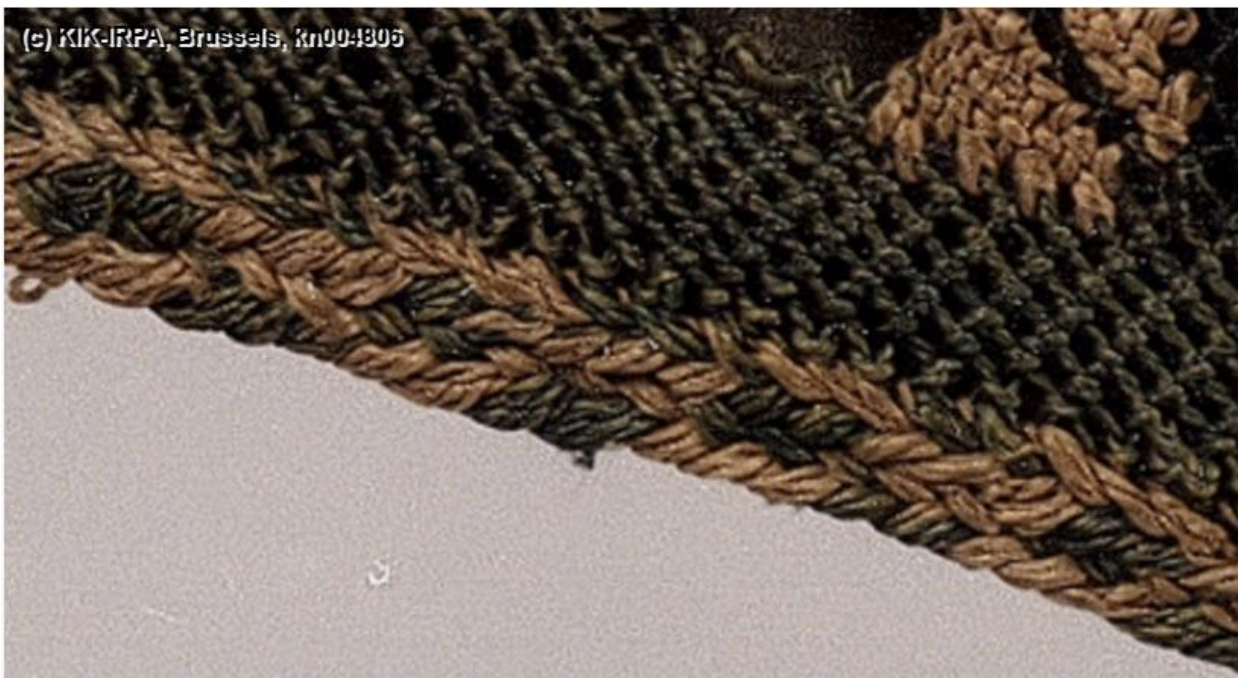
Fig 7. Embroidered Hairnet. C 1201-1300. Silk checkpoint embroidery. Saint Paul's Cathedral, Liège.

Fig 6 provides a close up of the additional loops on this net. It shows a style of additional loops partway around the bottom of the net. Another piece from St. Truiden (13th Century) exhibits loops like this along part of the edge. There are other types of additional loops, more like just another row of netting, which can be seen on other nets such as the one in Fig 3 and the one in Fig 9.