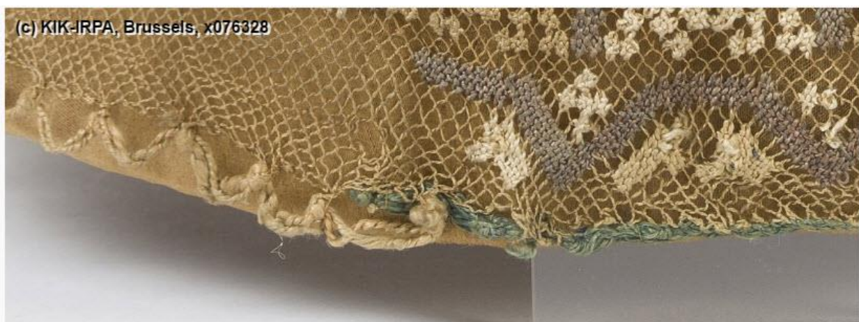
Fig 9. Embroidered Hairnet. C 1201-1300. Silk knotted net with silk embroidery. Assumption Church O.L.Vrouw, Saint Truiden.

Fig 9 is a close-up of the transition that clearly shows the braid is sewn on (around the braid rather than through it in this case) in a thread that matched the braid in color, and then the additional loops which were netted on to about every 4 th loop at a much larger gauge than the rest of the net. It is clear the braid would easily have fit through these additional loops. From other images of this piece, it is clear that the loops went around about half of the piece.