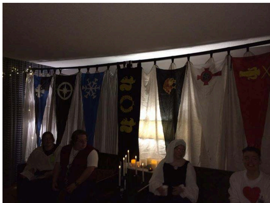
View of the hangings on the pipe and drape system behind the benches in the cabana room