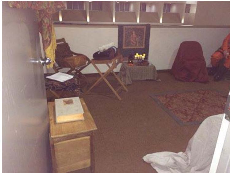
View of the decorated balcony

Below are several views of our decorated room.