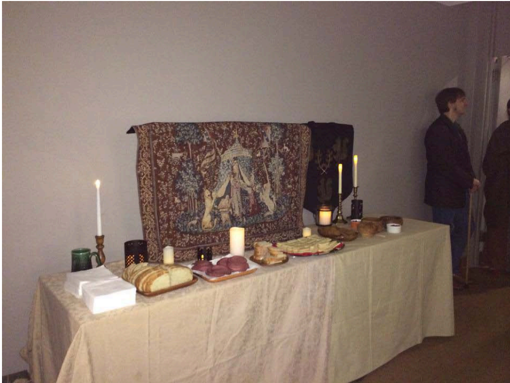
Covered big screen TV and bureau in cabana room. Note our battery operated candles!

We also had a fighting demo and a dance demo. Below are pictured the gentles who volunteered for the fighting demo. Lady Azizah bint Da'ud and Lady Idonea le Lakere also helped with the fighting demo.